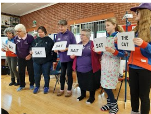
Understanding, through visual aids, how DNA works, and how the matches are found. Fascinating!