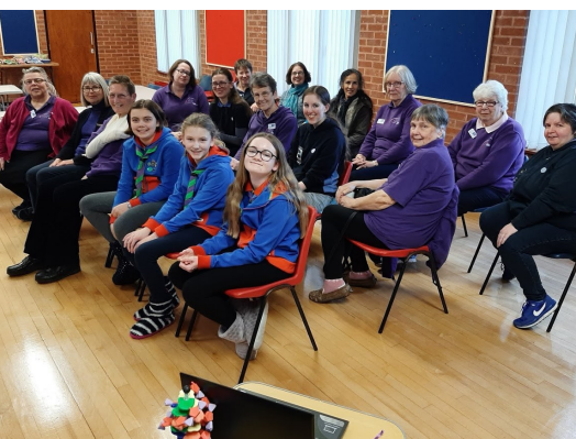
An enthusiastic audience ready to listen to the story of Grandfather - was he a WW2 hero? DNA will give the answer!