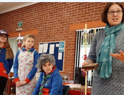
Princess Mary's tin which contained Christmas presents sent to those in WWI trenches, carried by Grandfather as his 'good luck' charm.