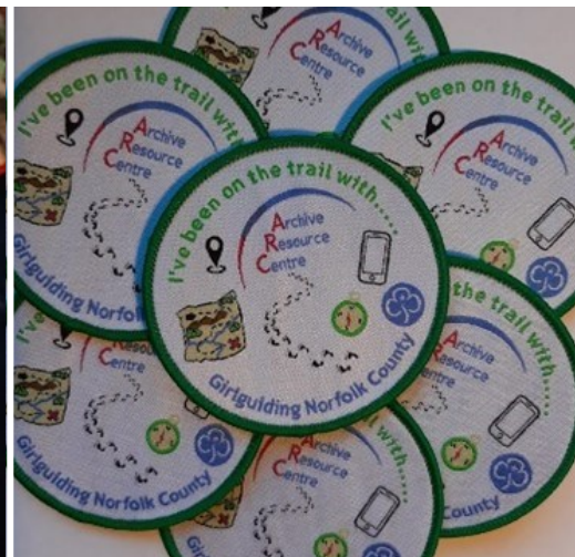
Badges available for those who follow the trail.