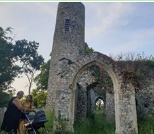
Sorting out the trail, although slightly off track here...