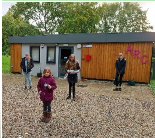
Stalham District Rangers socially distanced geocaching.