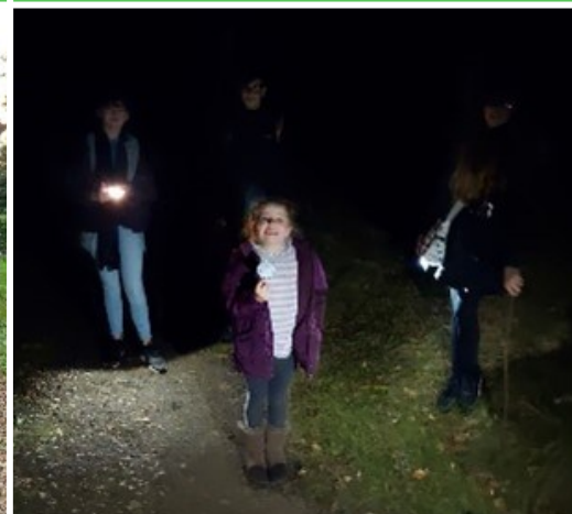
Having a go in the dark!