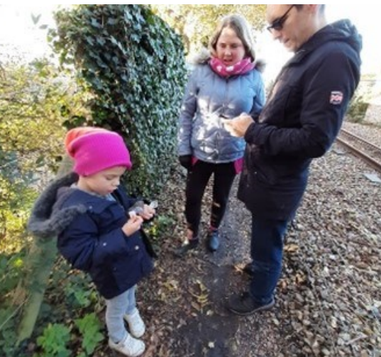
A great family activity for all ages.