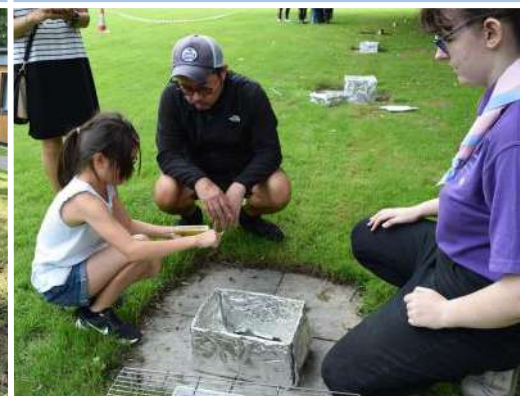
How to light a match and then light the charcoal inside the cardboard oven - used to cook mini-pizzas and scones!