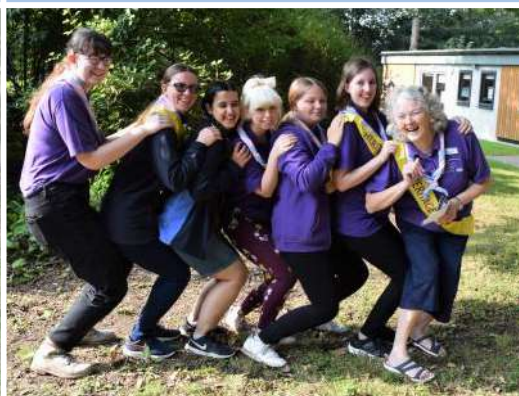
It's been hard work and lots of fun... so let's have a rest... a la Empress Eugene's circle. What a FAB team - well done all!