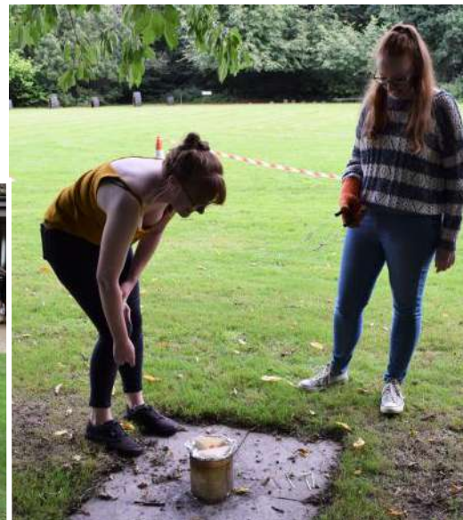
Fancy a bit of French toast? Absolutely the best... on a tin can over a buddy burner.