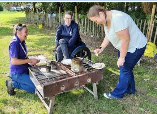
Lots of cooking methods here, for everyone to reach, and camp donuts are the winners!