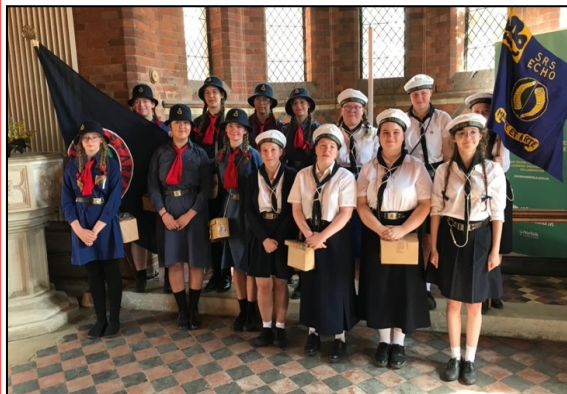
Guides and Sea Rangers at 1940s camp in 2022